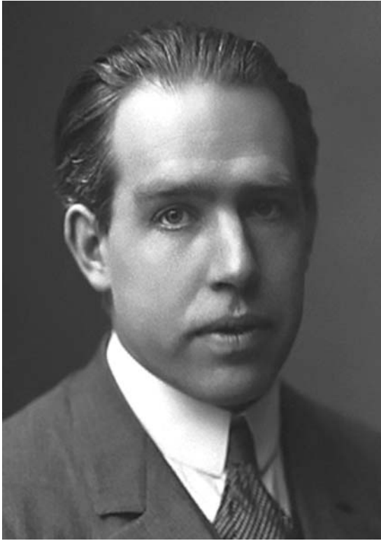
Niels Bohr (1885–1962)