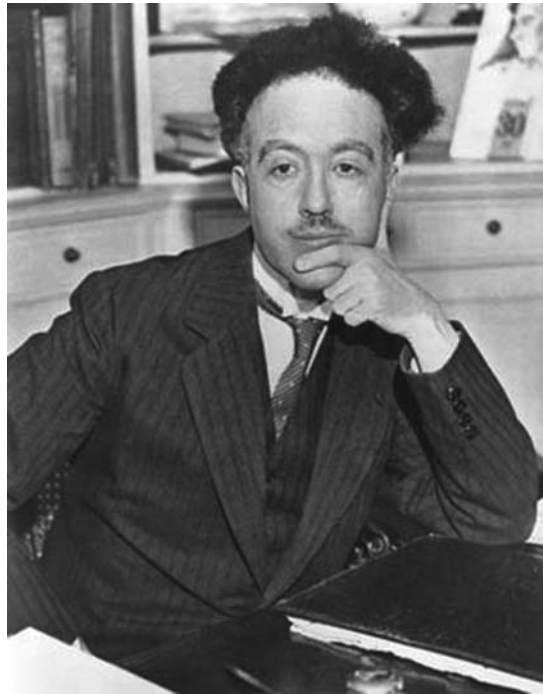
Louis de Broglie (1892–1987)

In the Gita, this is illustrated by the total unidentifiable river water terminating at the vast unfathomable ocean which is unaffected though constantly being filled. 42 Also, in the Gita, Sri Krishna’s advice to Arjuna is to absorb worldly opposites and be trigunatita or nirguna (2.45). One is required to be nirguna , without quality or condition-less, beyond duality.